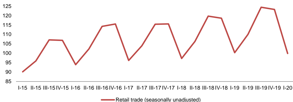
Fig. 1 Volume turnover index on retail trade

Tirana, June 18: In the first quarter 2020, the turnover volume index is 99.9. Sales volume on retail trade decreased 0.4 %, compared to the same quarter 2019. This indicator seasonally adjusted, compared with the previous quarter decreased 4.3% mainly influenced by March.