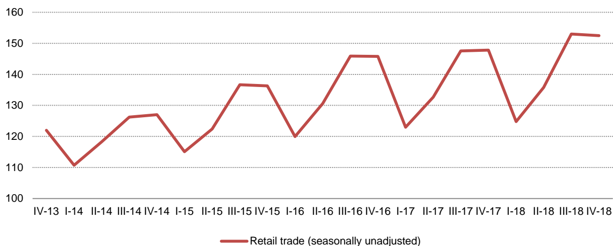
Fig. 1 Volume turnover index on retail trade

Tirana, March 13: In the fourth quarter 2018, the turnover volume index is 152.5 increasing 3.2 %, compared to the same quarter 2017. This indicator seasonally adjusted, compared with the previous quarter decreased 0.1%.